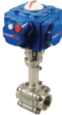
Fugitive Emission Bonnet