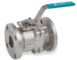
Flanged, full port #150/#300 F73G/F74G series