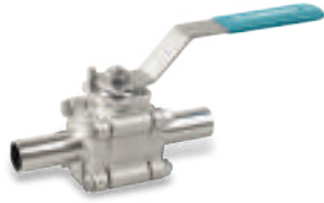
Three-piece, tube port F48G series