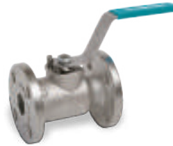
Flanged, #150/#300 F31G/F32G series