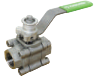
Spring-Loaded Locking Device (LD)