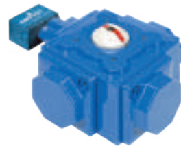
IMPACT™ Spring Assist