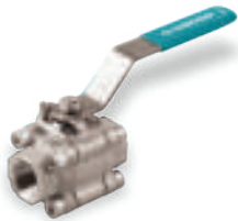
Three piece F47G series