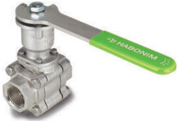
Spring Return Handle (SRH)